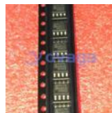
AD8170AR Analog Devices, Inc SOP8