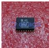
AD724JR Analog Devices, Inc SOIC-16