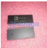
AD574AJNZ Analog Devices, Inc PDIP-28