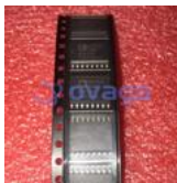
AD7401YRWZ Analog Devices, Inc SOIC-16