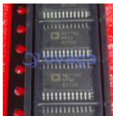
AD7192BRUZ-REEL Analog Devices, Inc TSSOP-24