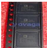
AD9680BCPZ-500 Analog Devices, Inc LFCSP-64