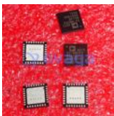
AD7124-8BCPZ-RL7 Analog Devices, Inc LFCSP-32