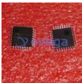
AD7938BSUZ Analog Devices, Inc TQFP-32