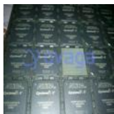
5CGXFC5C6F23C7N Altera Corporation (Intel) FBGA-484