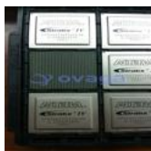
EP4SGX230FF35C3N Altera Corporation (Intel) FBGA-1152