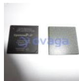
5CEFA2F23I7N Altera Corporation (Intel) FBGA-484