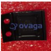
ADV7391WBCPZ Analog Devices, Inc LFCSP-3