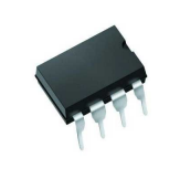
AMP03 Analog Devices, Inc DIP8