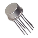
AMP03FJ Analog Devices, Inc CAN8