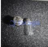
AMP03BJZ Analog Devices, Inc TO-99