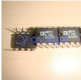
AMP03GP Analog Devices, Inc PDIP-8