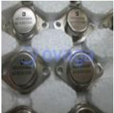
AD3554AM Analog Devices, Inc TO-3/F2