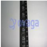
AMP03GS Analog Devices, Inc SOIC-8