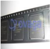
LT1013AMJ8 Analog Devices, Inc CDIP-8