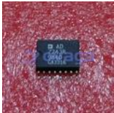
AD724JR Analog Devices, Inc SOIC-16