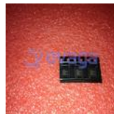
ADV7390BCPZ Analog Devices, Inc QFN32