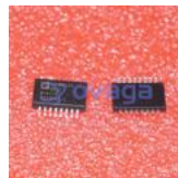
ADUM4160BRIZ Analog Devices, Inc SOIC-16