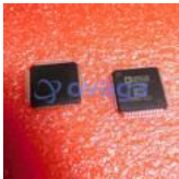
ADV7181CBSTZ Analog Devices, Inc LQFP-64