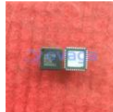
ADV7393BCPZ Analog Devices, Inc LFCSP-VQ-40