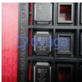
ADV7341BSTZ Analog Devices, Inc LQFP-64