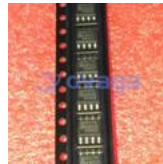
AD8170AR Analog Devices, Inc SOP8